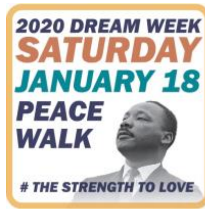
Peace Walk & Musical Celebration! Saturday, January 18