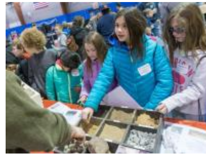
9th Annual Science Festival Wednesday, March 4