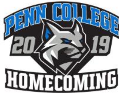
Penn College Homecoming Weekend October 4-6