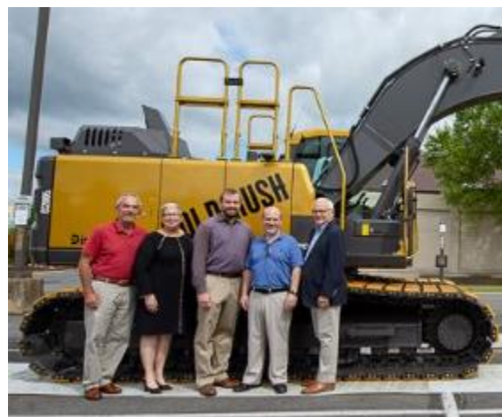
Student interaction among highlights of legislative visit