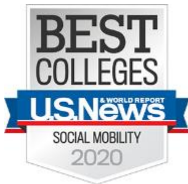
College continues strong showing in 'Best Colleges 2020' rankings