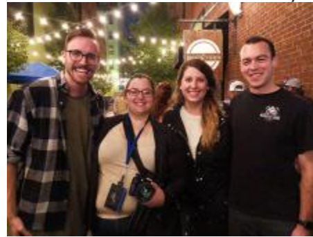
Wildcats on Pine Square