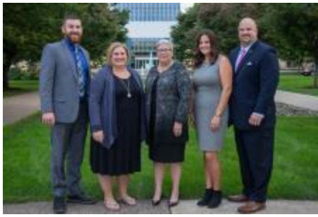
Athletic Hall of Fame