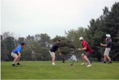
Alumni Golf Outing