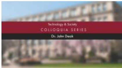
Colloquia Series: The Great War and the Forgotten Realm Friday, November 8