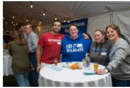
Alumni & Friends Tent Party