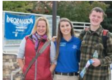
Penn College Open House Sunday, October 28