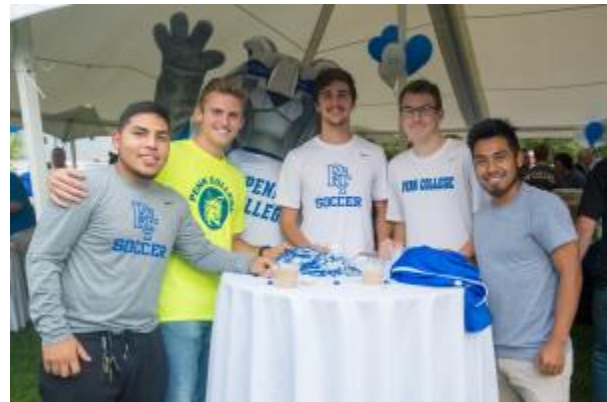
Alumni and Friends Tent Party Friday, October 5