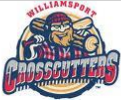
Penn College Night with the Crosscutters Tuesday, August 28