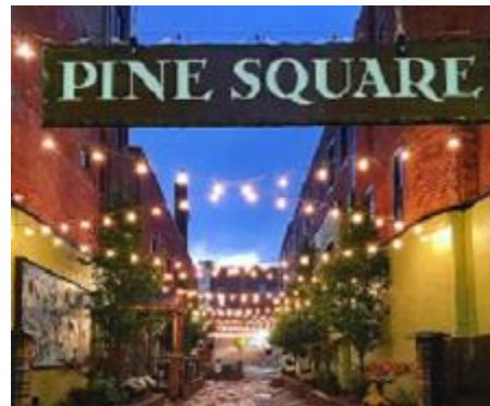
Wildcats on Pine Square Saturday, October 6