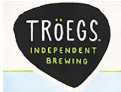
Alumni Networking at Tröegs Brewing Company Friday, September 14