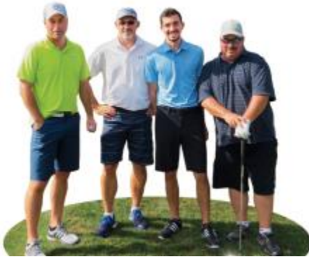
Alumni Golf Outing Saturday, October 6