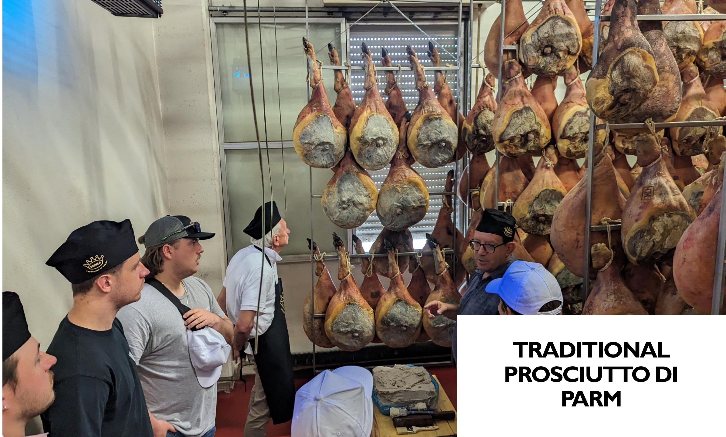
TRADITIONAL PROSCIUTTO DI PARM