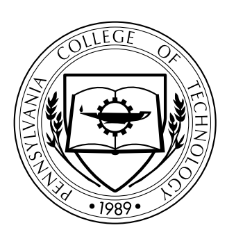
Public Relations & Marketing

Copy can be added under or above, but not around the official seal.