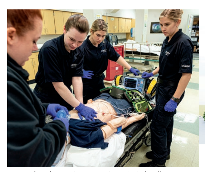
Paramedic students receive immersive instruction in the college's state-of-the-art paramedic facilities.